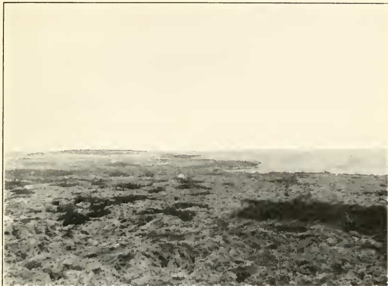
BARE LIMESTONE SHORE.

Beata Island, Dominican Republic, May 12, 1931.